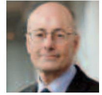
MARC SANSON commissioner

THE FRENCH NUCLEAR SAFETY AUTHORITY (ASN) , was created by the law of June 13th, 2006 (also known as the TSN law) concerning nuclear transparency and security. On behalf of the State, it supervises nuclear safety and radiation protection, in order to protect workers, patients, the public and the environment from the risks related to nuclear activities. It also contributes to informing the public.